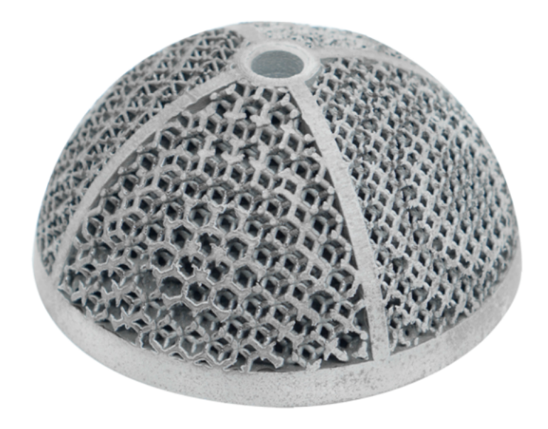
Sample of 3D-Printed Medical Implant