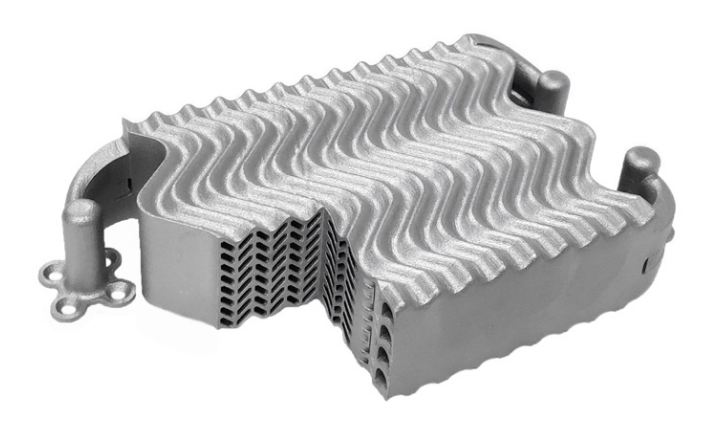
Sample of 3D-Printed Heat Exchanger