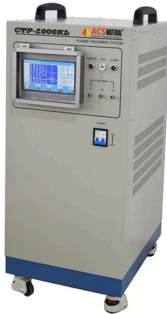
Photo of a CTP-2000KL Equipment

High-Voltage Low-Frequency Digital Plasma Power Supply is a DBD (Dielectric Barrier Discharge) treatment device, designed to support various types of DBD discharge electrodes. The high-voltage electrode of the DBD electrode to be used should be connected to the high-voltage interface of this equipment, while the low-voltage electrode should be connected to the low-voltage interface. After turning on the power via the circuit breaker, the voltage, current, power, frequency, and other parameters can be adjusted via the touchscreen to generate an ionized layer in the electrode. The external interface allows for voltage waveform monitoring, instantaneous current detection, and integrated current detection.