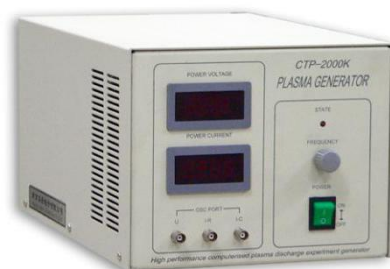
Photo of Differential Output Low-temperature Plasma Experimental Power Supply