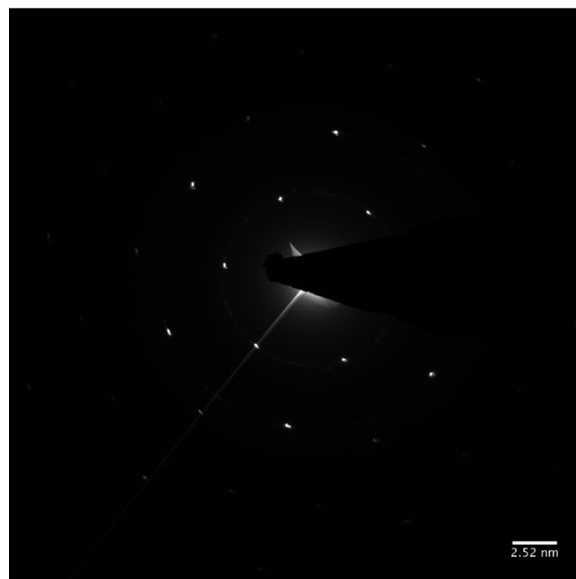
Typical Crystal Diffraction Image of ACS Material Monolayer hBN