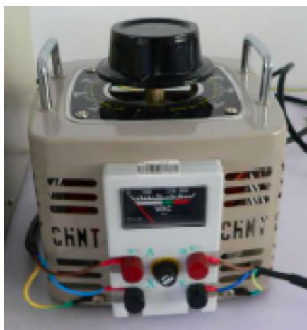
Photo of Voltage Regulator