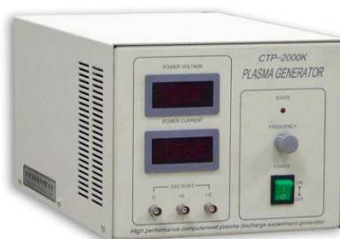
Photo of Modulated Pulse Low-temperature Plasma Experimental Power Supply

Rated input voltage: 220v | Rated capacity: 1kVA | Frequency: 50Hz | Output voltage range: (0-250) V Rated output current: 4A | Number of phases: 1 | Weight: 6.5kg | Insulation heat class: F