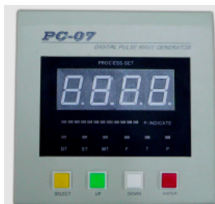
Photo of Digital Pulse Modulator Panel