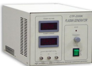
Photo of Modulated Pulse Low-temperature Plasma Experimental Power Supply

Frequency adjustment range: 10Hz ~ 1000Hz. Duty cycle adjustment: 1% to 99%.