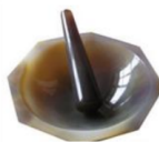
Agate Mortar and Pestle