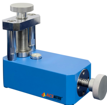
Photo of Mini Infrared Tablet Press Machine