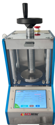
Photo of Tablet Press Machine