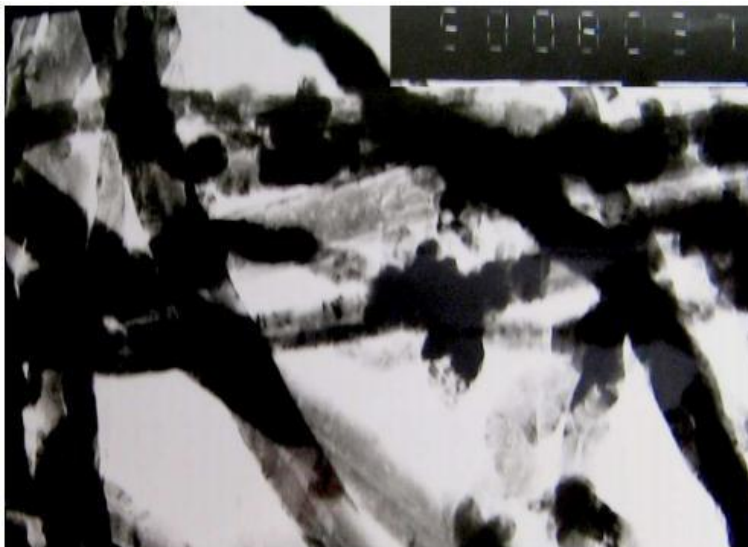
TEM Image of ACS Material Purified MWNTs-COOH (Length <math><10 \mu\text{m}</math>)