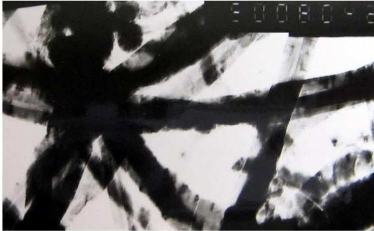
TEM Image of ACS Material Purified MWNTs-OH (Length <10 \mu\text{m} )