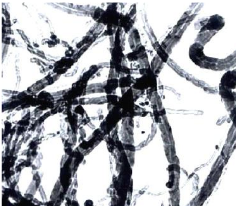
TEM Image of ACS Material Purified MWNTs (Length <10 \mu\text{m} )